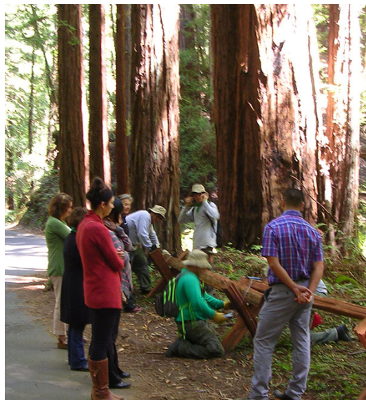
Youth Ecology Corps Fence Building