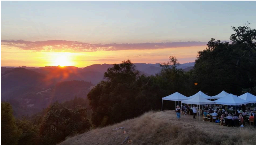
Sunset Dinner – 2015