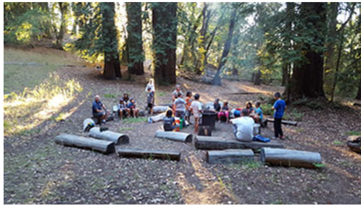
Day Camp Overnight