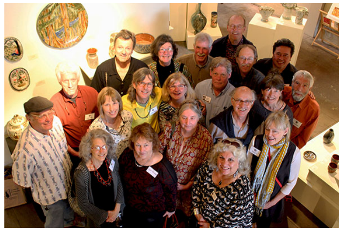
Pond Farm Student Reunion