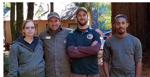
Field Operations Staff 2016